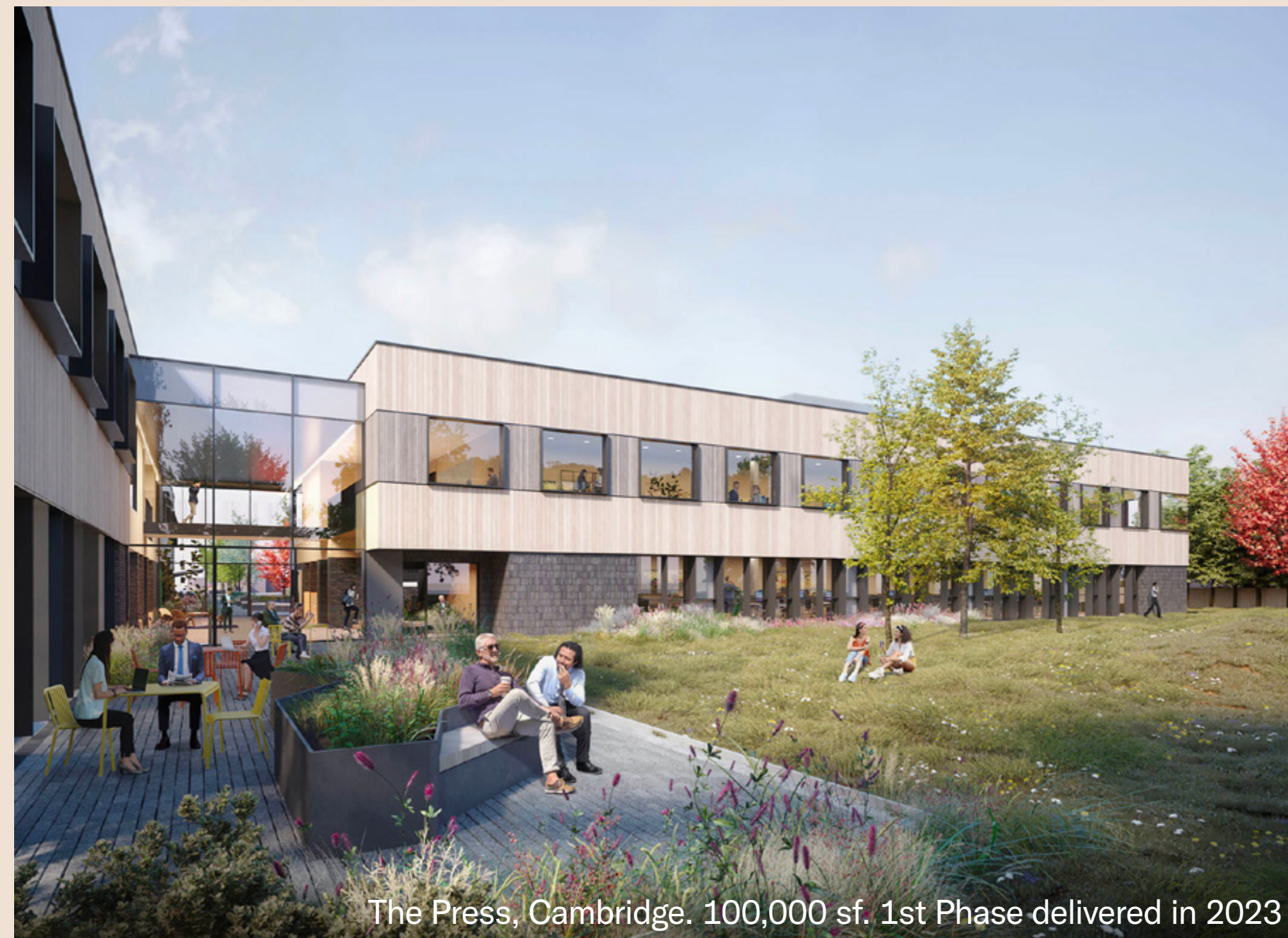
The Press, Cambridge. 100,000 sf. 1st Phase delivered in 2023