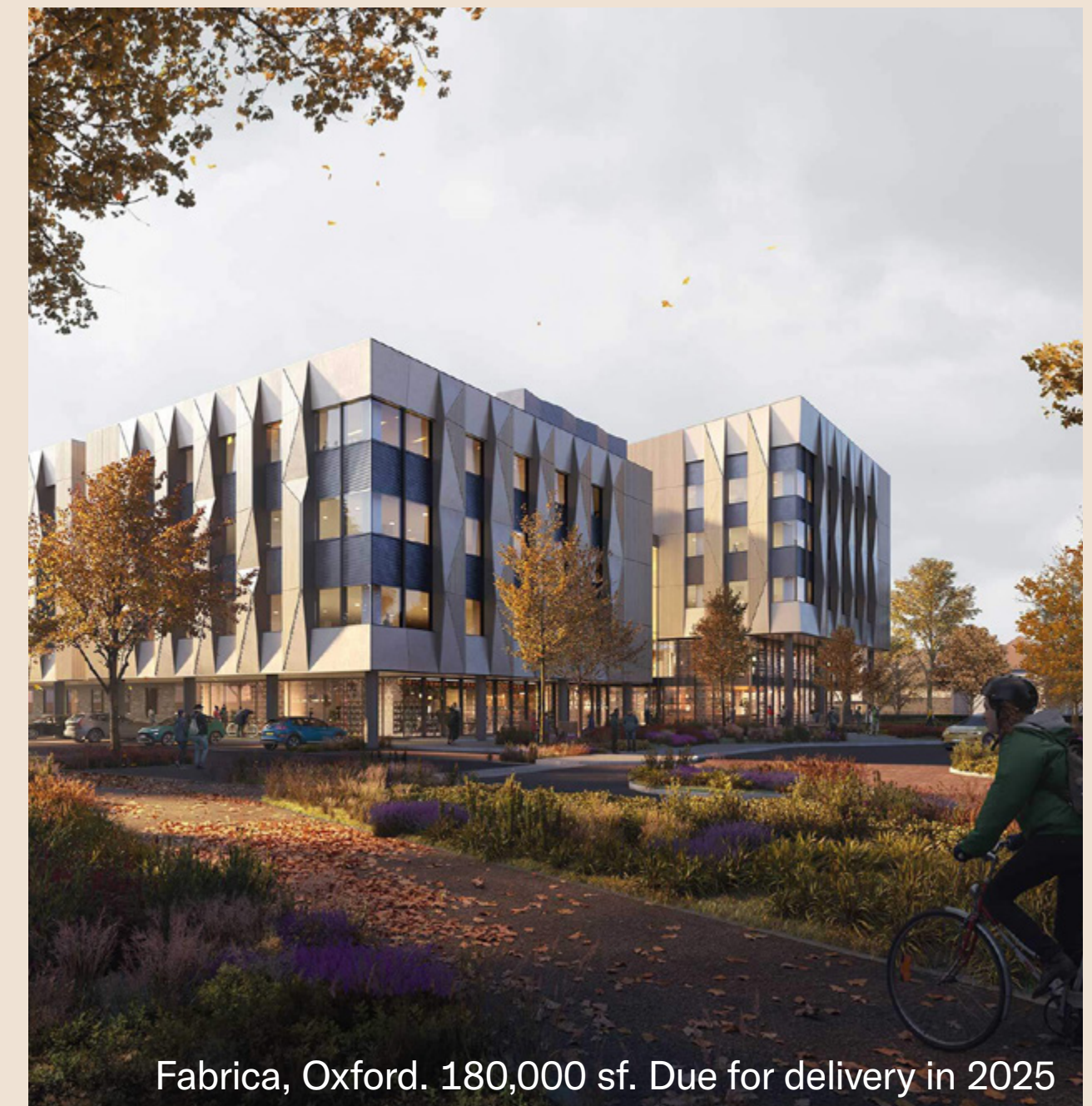
Fabrica, Oxford. 180,000 sf. Due for delivery in 2025