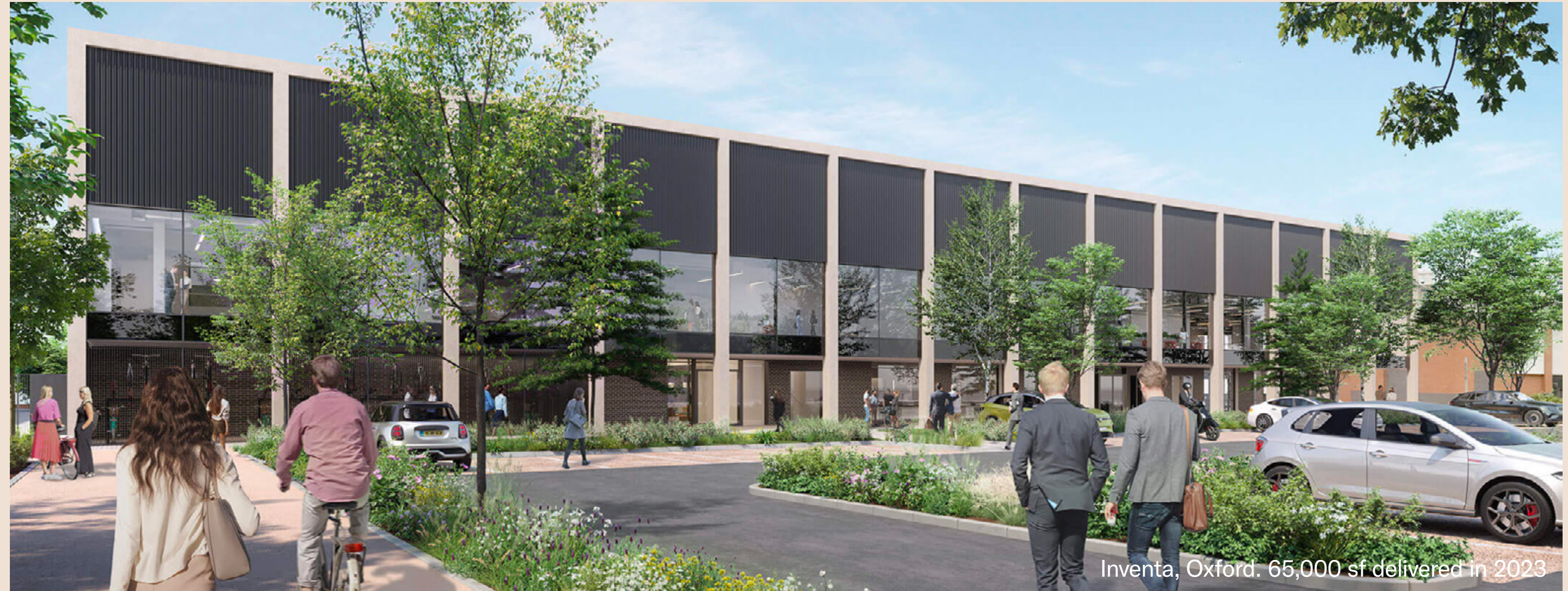
Inventa, Oxford. 65,000 sf delivered in 2023